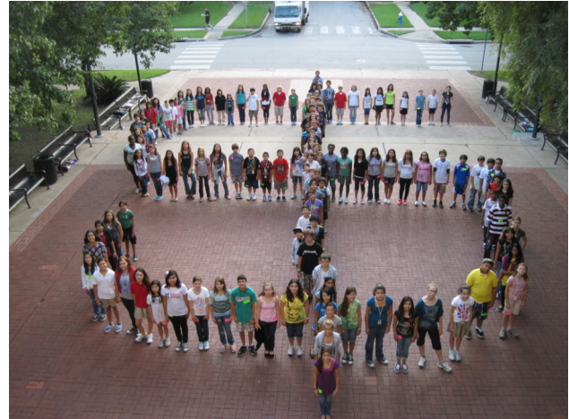
Lanier MS millionaire club members pose for an unique picture.