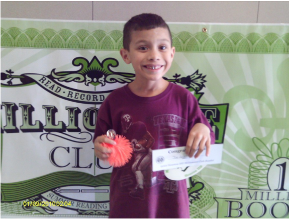
Herrera ES student is excited to receive prizes for reading