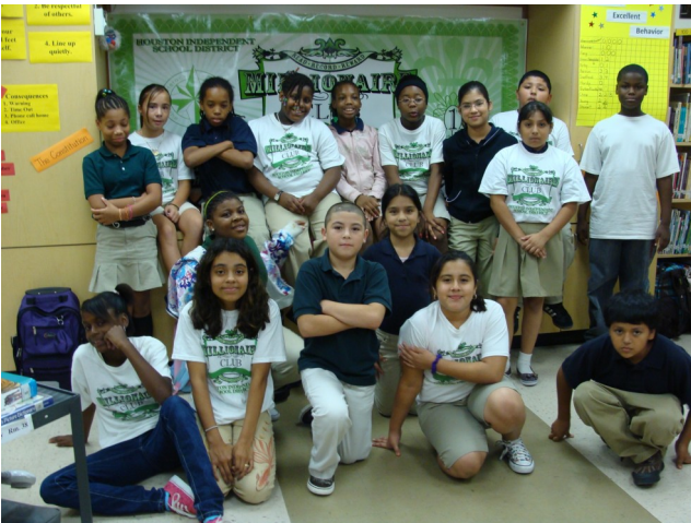
McDade students pose with Millionaire Club banner